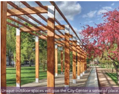
Unique outdoor spaces will give the City Center a sense of place.