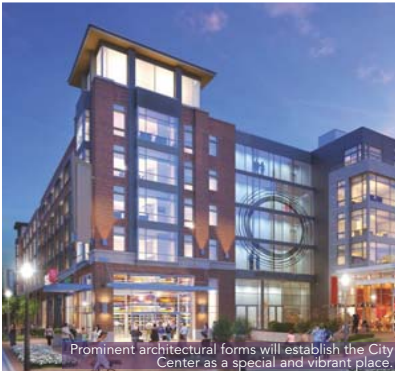
Prominent architectural forms will establish the City Center as a special and vibrant place.

The Lone Tree City Center will attract a critical mass of people, places and smart city / Internet of Things (IoT) opportunities that help to provide competitive business advantages and enhance quality of life. This eminently walkable environment will be stitched together with great streets, vibrant parks and plazas , and easy light rail transit and pedestrian connections.