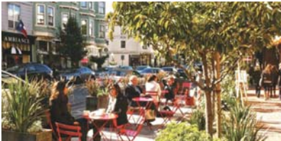
The City Center will provide an authentic downtown experience.