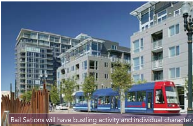
Rail Stations will have bustling activity and individual character.