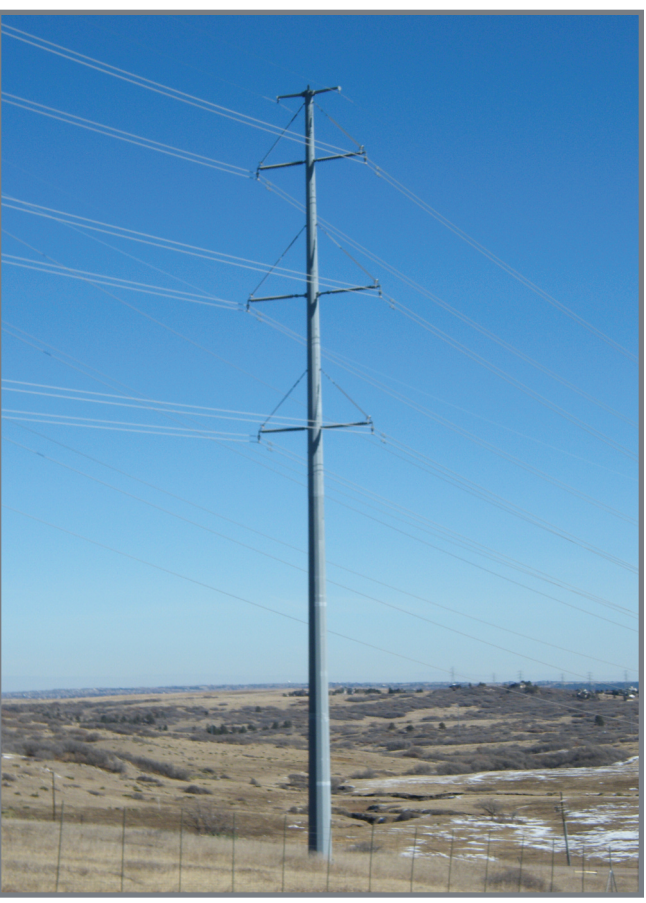
Construction on the Northern Colorado Area Plan includes single-pole steel structures ranging between 80 and 130 feet in height.