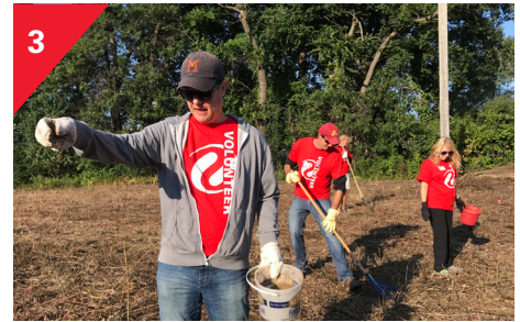
Xcel Energy employees and non-profit organization Great River Greening planted milkweed outside our Blue Lake Power Plant in Shakopee.