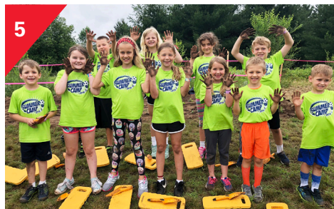
Children helped plant native wildflowers outside our company office in Eau Claire.

Learn more about our pollinator program by visiting xcelenergy.com/Pollinator .