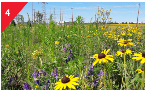
More than seven acres of pollinator habitat surround our substation in Monticello.