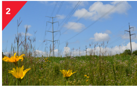
We partnered with the City of Cottage Grove and the Minnesota Department of Natural Resources to restore 60 acres of native prairie habitat under transmission lines.