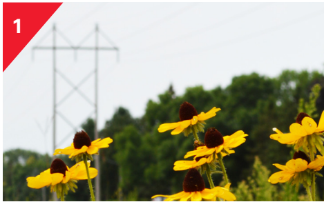
The City of Bloomington partnered with us to plant six acres of pollinator habitat under transmission lines.