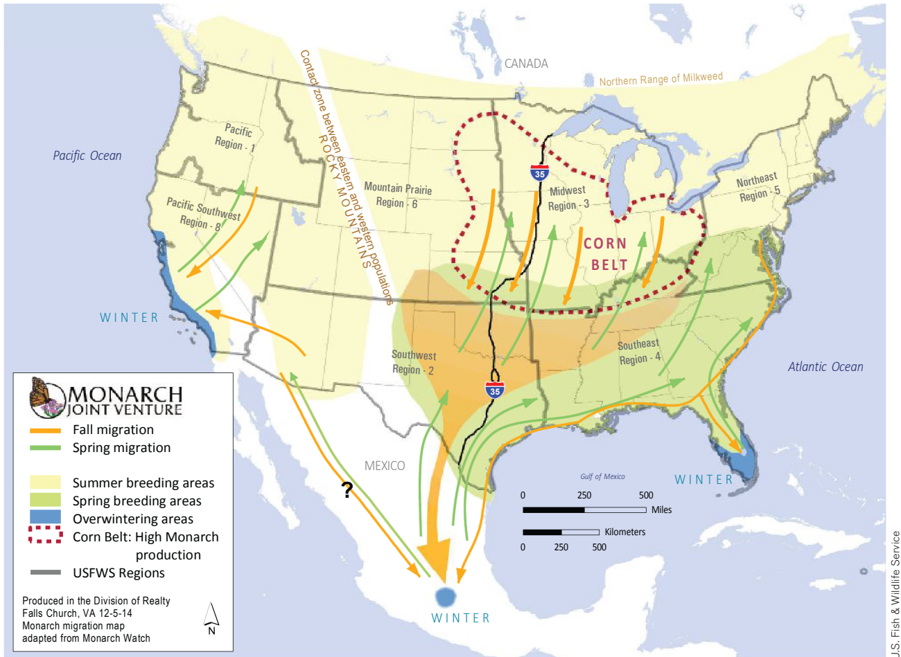
Figure 1: Monarch Populations and Migration in North America

landscapes to important pollinator habitat being created within our natural gas and electric rights-of-way.”