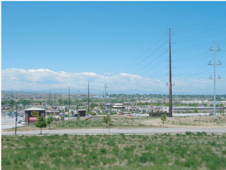
Galvanized Steel Structure Option