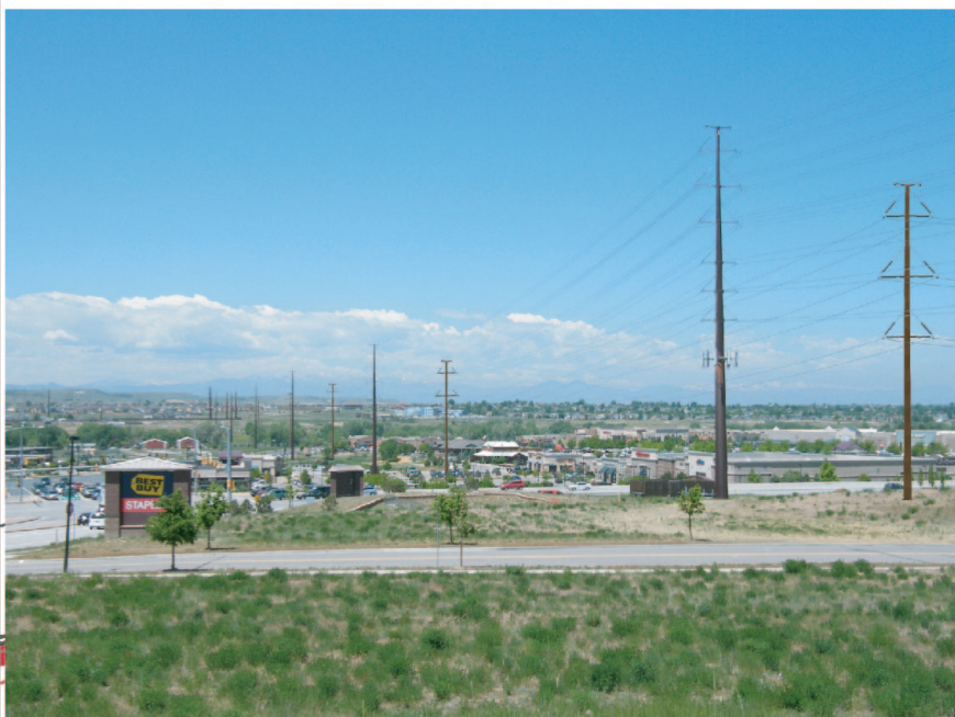
Self-Weathering Steel Structure Option