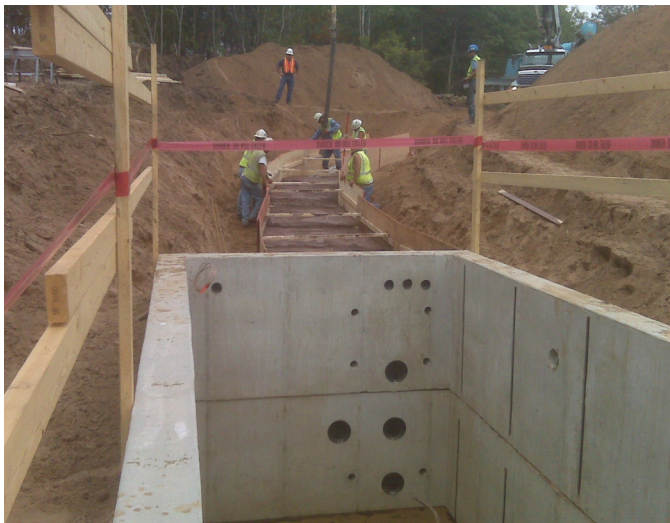
Crews work on an underground duct bank extending from a typical 8'x 8'x24' vault

Burying high-voltage transmission lines may be appropriate in densely populated urban and suburban settings, near airports, or when sufficient right-of-way is not available for an overhead line. Electric utilities consider the following factors when deciding whether to construct high-voltage transmission facilities above ground or bury them: