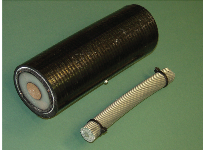
Underground cable and smaller overhead conductor.