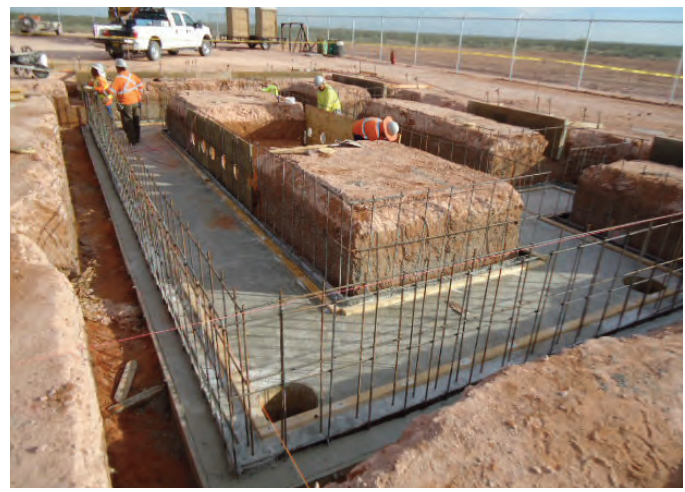
Substation work has begun on the Custer Mountain-Ponderosa 115 kV transmission line near Jal, N.M. Crews work on excavating and framing the control house that will sit at the new Ponderosa Substation about eight miles west of Jal.