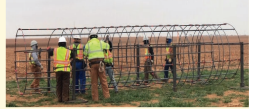
Crews build a rebar cage that will be used for a foundation on the final segment of the TUCO-Yoakum-Hobbs transmission line in Hale County, Texas.