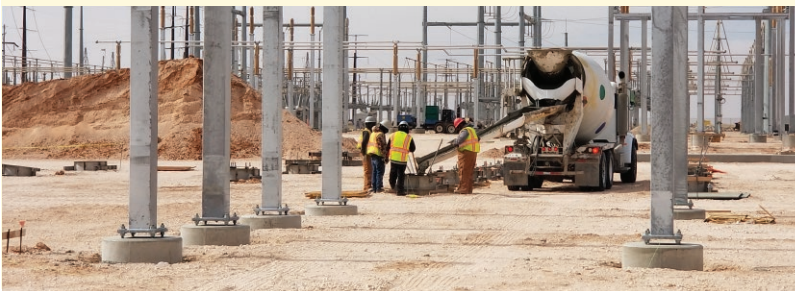
A foundation is poured for the Yoakum Substation expansion near Plains, Texas.

Other projects completed this year include several stretches of 115-kilovolt transmission line: 7 miles in Eunice, N.M., 15 miles in Carlsbad, N.M., and 9 miles in Yoakum County, Texas.