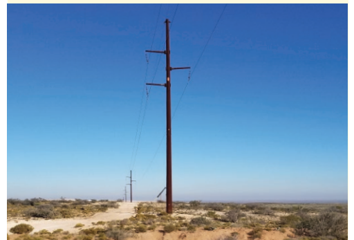
The 115-kilovolt Potash Junction-Livingston Ridge transmission line was placed in-service in April 2019 in Eddy County, N.M.