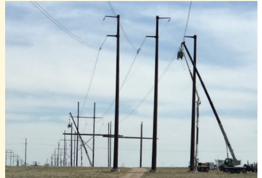
Crews finish stringing work on the Yoakum-Hobbs transmission line project near Hobbs, N.M.

The TUCO-Yoakum-Hobbs project will include: